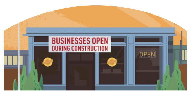
A COMMITMENT TO THE SUSTAINABILITY OF OUR COMMUNITY

Metro BIF's Goal: Help small "mom and pop" businesses directly impacted by Metro transit rail construction continue to thrive throughout construction and post construction.